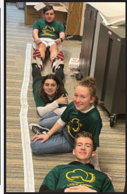
Inside the Food Drive! (page 2)