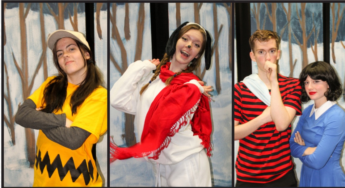
Charlie Brown, Theatre, and the Food Drive (page 1)

The Student Newspaper of Granite Falls High School