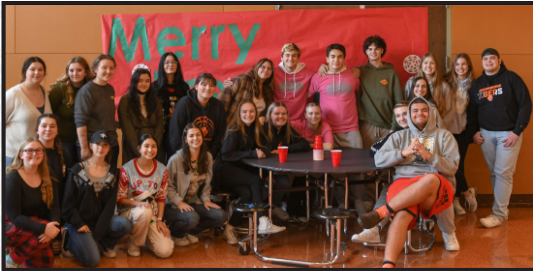
Ignite presents a Very Merry Freshmas! (pages 3 & 4)